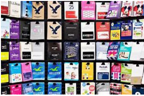
Gift Card scams