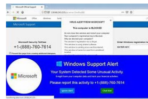
Tech Support scams